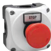
LPZ P1 B8 02