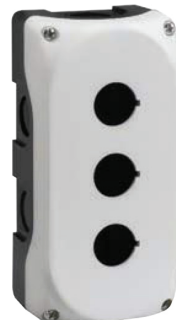
LPZ P3 A8