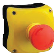
LPZ P1 B5 03