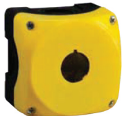
LPZ P1 A5